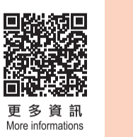
更多資訊 More informations